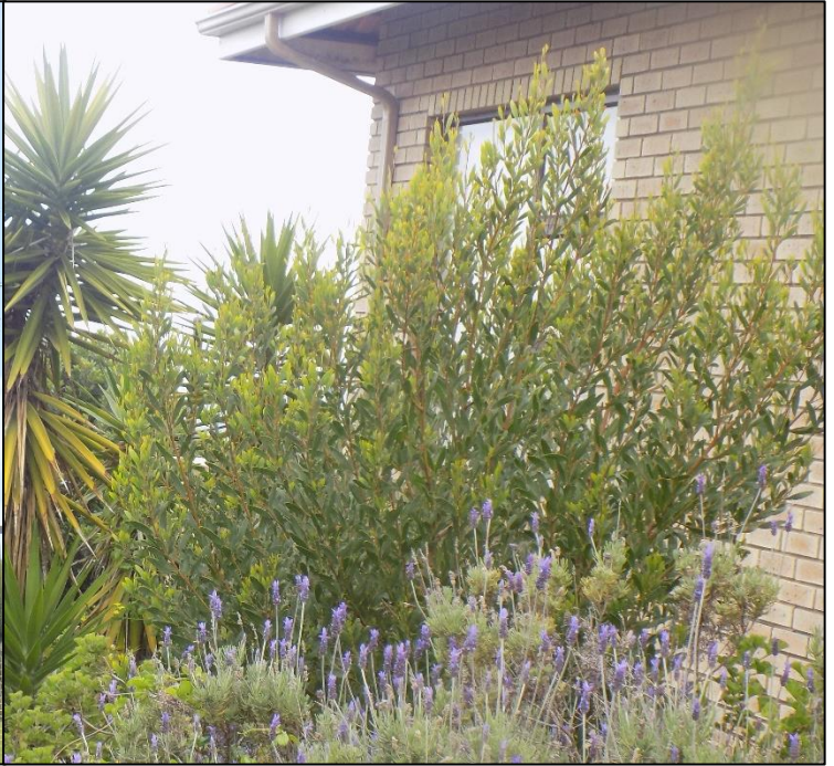
Rooikranz (Acacia cyclops)