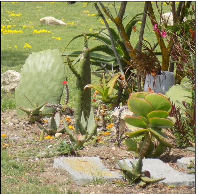
Prickly pear (Cacti)