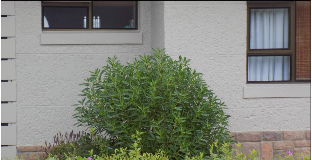
Manatoka ( Myoprum tenuifolium subsp Montanum )