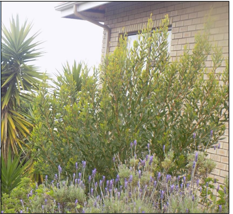
Rooikranz (Acacia cyclops)