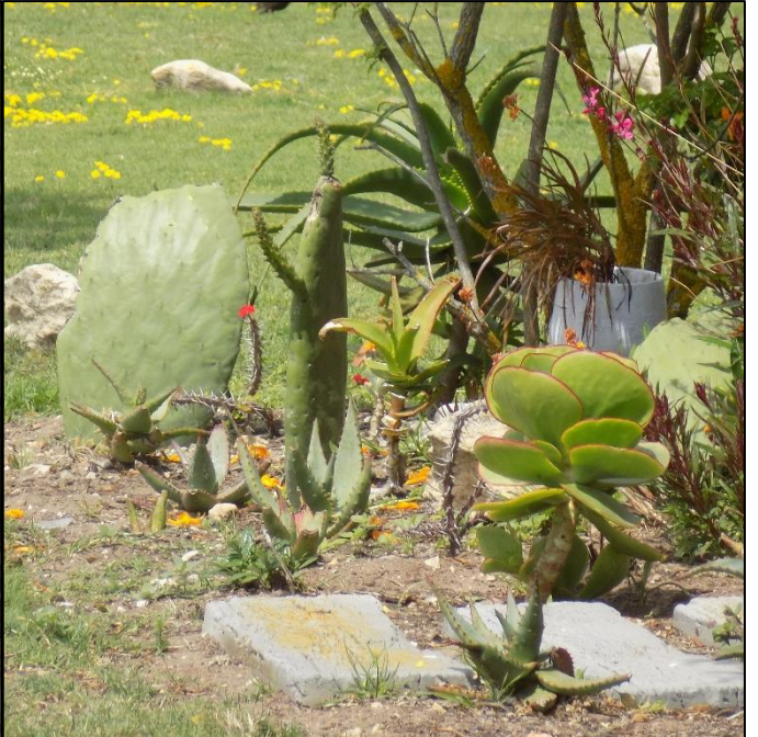
Prickly pear (Cacti)