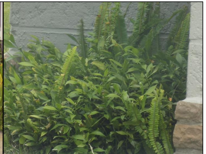
Sword fern ( Nephrrolepis cordifolia )